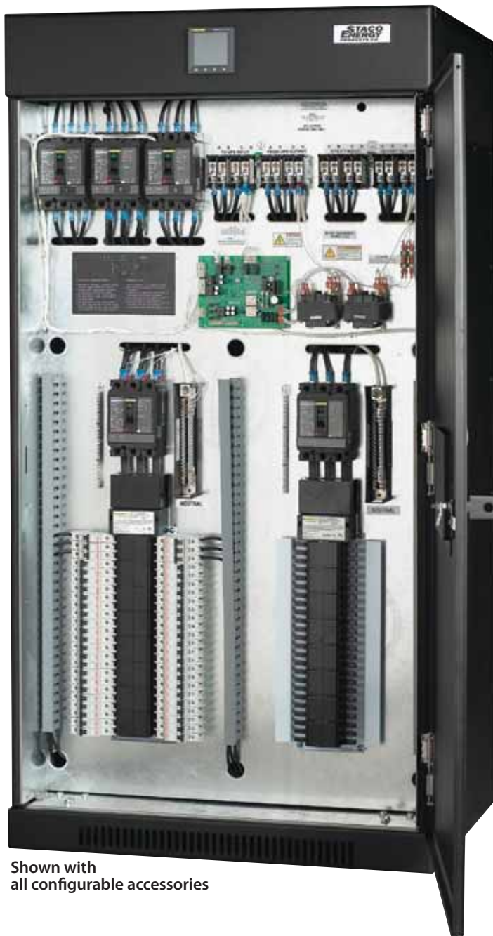
Shown with all configurable accessories