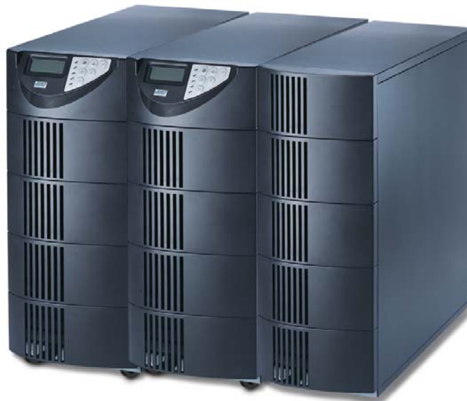
UniStar ® P Series Tower shown paralleled and with battery cabinet